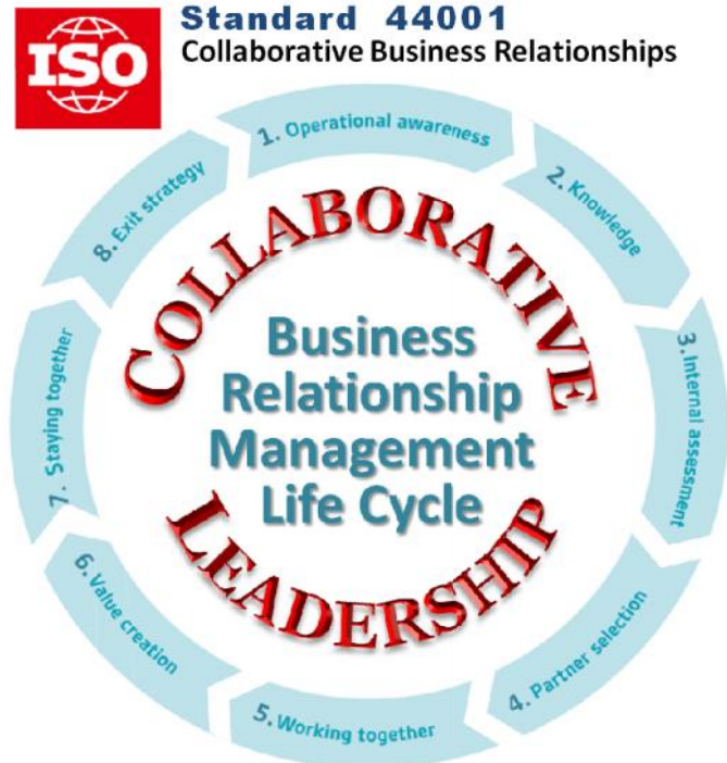
Figure 4: Collaborative Leadership & Life Cycle

Collaborative Business Standards present a massive opportunity for leadership development at a time of major leadership losses with baby-boomers retiring at unprecedented levels.